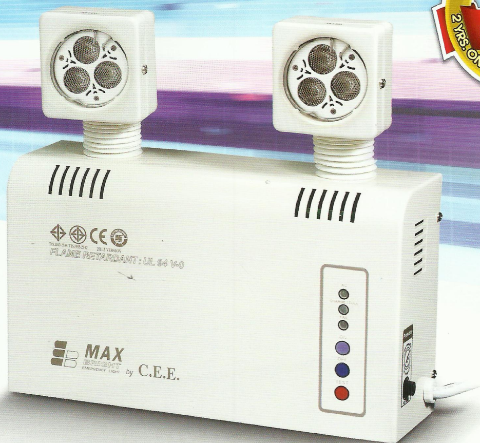
MB - LD